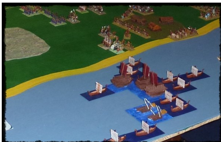
Neils Sung vs. Jürgens Vikings